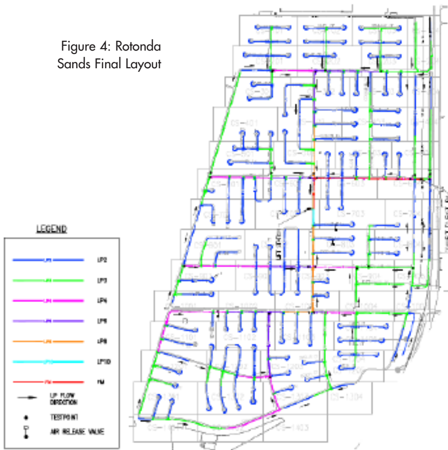
Figure 4: Rotonda Sands Final Layout